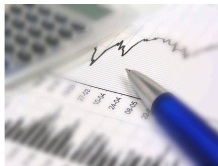
Insurance Industry 14th Edition